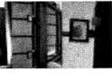
During: LED fixtures at passenger drop-off area