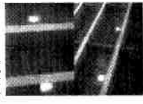
Before: Passenger dropoff area lights